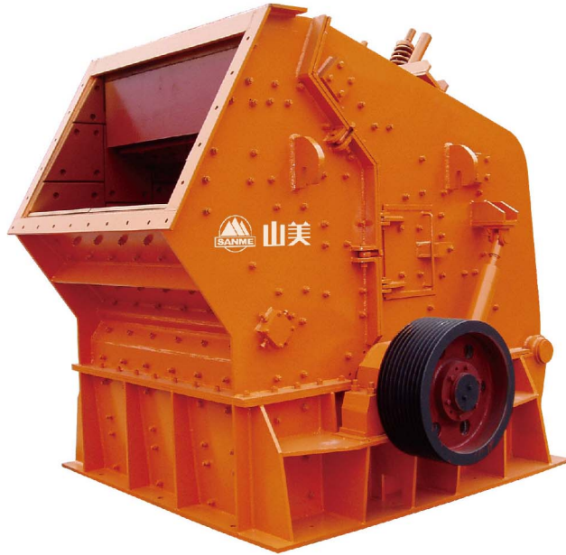
结构图 Structure Drawing